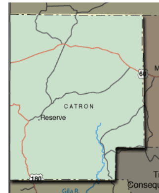
Figure 4: Map of Catron County.