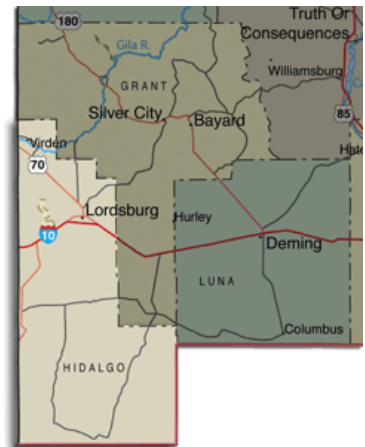
Figure 6: Map of Hidalgo County.

The mining town of Playas was sold recently to New Mexico Tech University, and Playas is now used for homeland security training. Major employment in Hidalgo County includes government, retail (including accommodation and food service), and agriculture. 22 Hidalgo County's growing economic promise includes a major chile processing plant, a tilapia farm, as well as geothermal and solar energy industry. The 2010 Census lists Hidalgo County population at 4,894, 23 with projected growth to 8,051 by 2035. 24