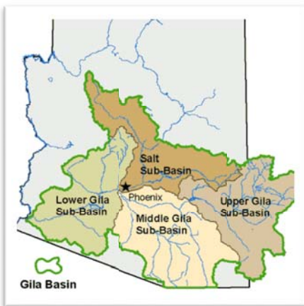
Figure 2: Gila Water Basin

While most New Mexicans think of the Gila River as a New Mexico resource, the majority of it actually flows in Arizona.