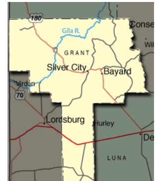
Figure 3: Map of Grant County.

At nearly 7,000 square miles, Catron County 13 is New Mexico's largest by geography. With a portion of three national forests within the county, hiking, camping and fishing are major draws for recreational visitors. Reserve is the county seat, and there is rich mining history in the town of Mogollon. Other historic draws are the legends of famous Apache leaders who once lived in Catron County including Geronimo and Cochise. A major tourist attraction is the Catwalk national recreational trail along Whitewater Creek near Glenwood.