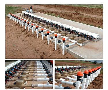
Drip irrigation has a water-use efficiency of 80-95 percent, resulting in an estimated water savings of 50 percent.